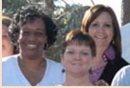
Finance Team ~ PAGE 2