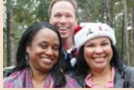
Ham Toss ~ PAGE 7