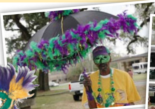
AltaPointe's Mardi Gras King prepares to roll.